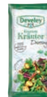
GARDEN HERBS DRESSING