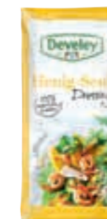
HONEY MUSTARD DRESSING