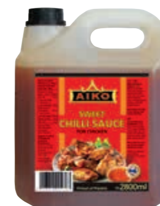
SWEET CHILI SAUCE