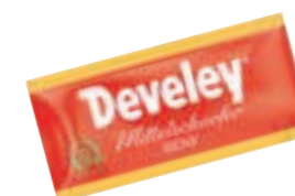
MEDIUM HOT MUSTARD