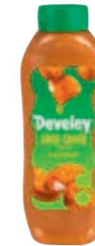
SWEET SOUR SAUCE