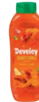
SWEET CHILI SAUCE