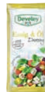
VINEGAR & OIL DRESSING