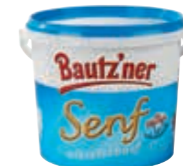
MEDIUM HOT MUSTARD