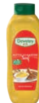
MEDIUM HOT MUSTARD