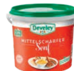
MEDIUM HOT MUSTARD