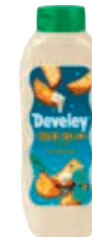
SOUR CREAM SAUCE