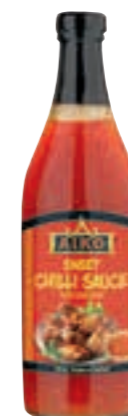
SWEET CHILI SAUCE